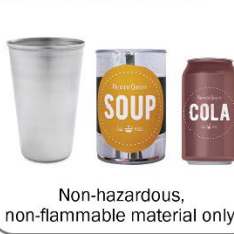
METAL CANS & CUPS

Non-hazardous, non-flammable material only.